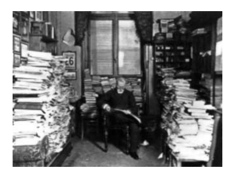
Fig. 3. Typical Paul Ehrlich: studying scientific literature in his office.